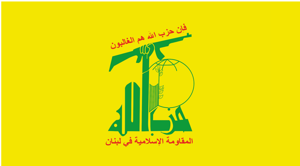
Flag of Hezbollah

Shortly after its founding, members of the organization carried out highly publicized attacks, including a suicide bombing that killed 241 US marines in Beirut in October 1983 9 . The organization went public under the name Hezbollah when it published its manifesto in 1985 10 . In the following years, due to massive material and financial support from the Islamic Republic of Iran, the „Party of God“ became one of the most powerful military factions in the Lebanese civil war. Hezbollah was able to establish and expand its dominant position, especially in the Shi'a strongholds in the Bekaa Valley and the southern city districts of Beirut — positions it maintains to this day.